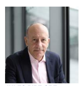
JULES PIPE CBE, DEPUTY MAYOR FOR PLANNING, REGENERATION AND SKILLS

The London Planning Awards demonstrate the quality and depth of London's built environment sector, setting the standard for the collaborative working required to meet the challenges associated with London's growth.